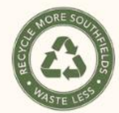
Recycle More Southfields