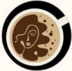
Il Caffetino Southfields