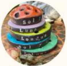
Sol y Luna